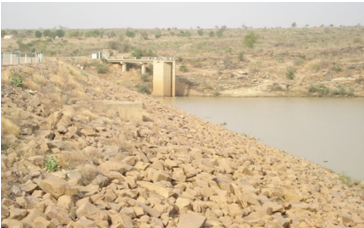
Doma Dam, Nassarawa with over 300 ha of irrigable land, and 35 MW Power

Its alliance with Quanta Energy in Hydro-Solar Projects are also beginning to yield fruits as the insatiable appetite of the national grid for juice can be met.